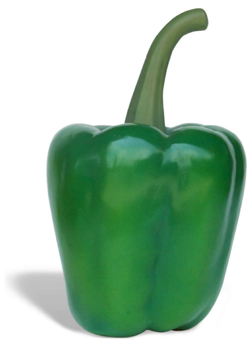
GREEN BELL PEPPER 17.75"L x 17.75"W x 28.5"H