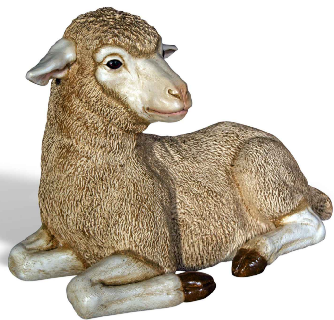
RESTING MERINO LAMB 22"L x 12.5"W x 15.5"H