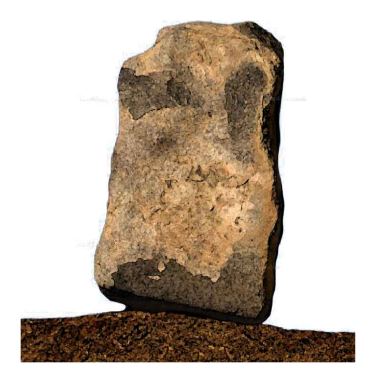
PRODUCT VIEW SCALE: NTS